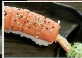
Hot Night Roll $13.95