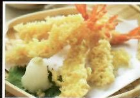
Shrimp Tempura $9.95