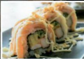
Salmon & Tuna Topping roll $13.95