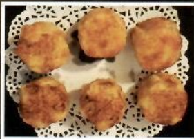
Shumai ( 6 pieces ) $6.50