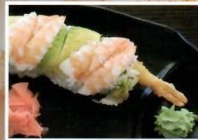
Dubble Dubble Roll $13.95