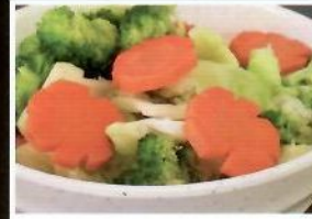
Veggie Bowl 7.99