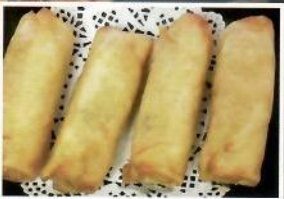
Vegetable Spring Roll $6.50 ( 4 pieces )