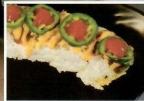
Mexican Roll $9.95