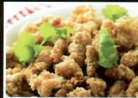
Popcorn Chicken $6.95