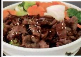
Beef Teryaki $10.99