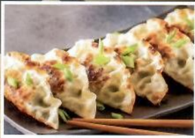
Gyoza ( 6 pieces ) $7.50