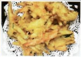
Vegetable Tempura $7.95