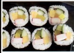
Sushi Kimbap $7.99