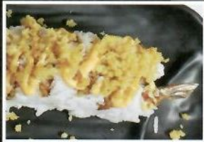
Crunch Roll $11.95