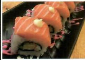
Salmon Topping Roll $13.95