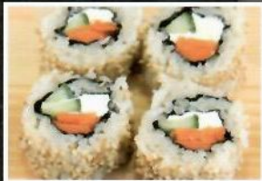
Philadelphia Roll $13.95