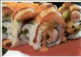
Las Vegas Roll $15.95