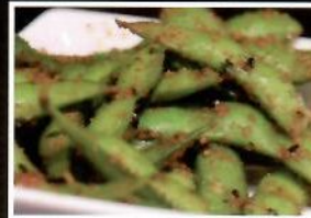
Spicy Edamame $6.50