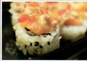
Volcano Roll $13.95