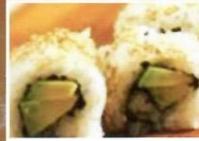
All Avocado Roll $11.95