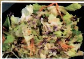
House Salad $7.50