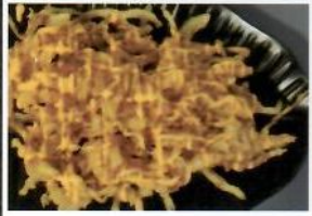
Crispy Roll $13.95