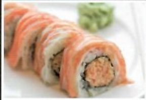
Lobster Roll $13.95