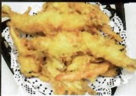
Mixed Tempura $8.95