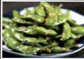
Garlic Edamame $6.50