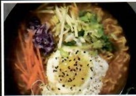
Spicy Ramen $9.95 Chicken $10.95 Beef $11.95