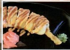
Golden Tiger Roll $13.95