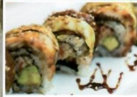
Dragon Roll $13.95