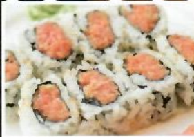
Spicy Tuna Roll $10.95