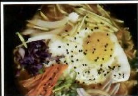
Mild Ramen $9.95 Chicken $10.95 Beef $11.95