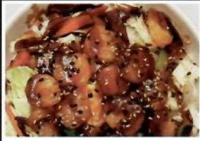
Shrimp Teryaki $9.99