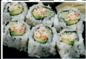
California Rolls $7.95