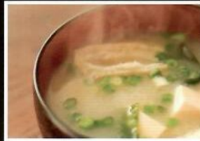
Miso Soup $1.95