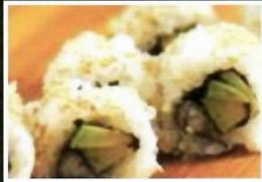
Salmon & Avocado Roll $15.95