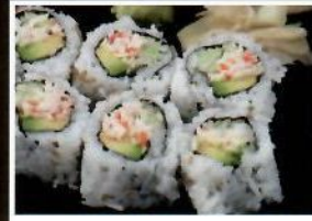
California Roll $6.99