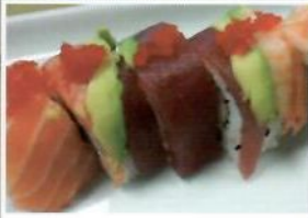
Rainbow Roll $15.95