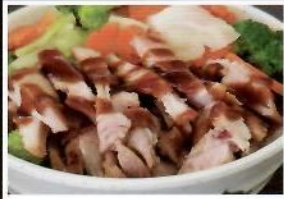
Chicken Teryaki $8.99