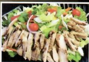
Chicken Salad $9.50