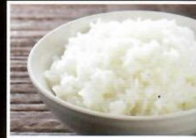
Steam Rice $1.95