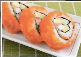
Masago Topping Roll $12.95