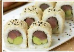
Tuna Avocado Roll $15.95