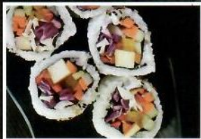
Vegetable Roll $9.95