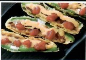
Jalapeno Bomb $5.95